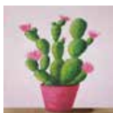
19 JULY CACTUS IN BLOOM