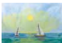
21 JUNE DAY AT SEA