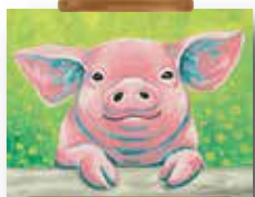
17 MAY POPPY THE PIG

Sign-up for these exciting "Sip & Create" sessions! Early registration for all sessions is encouraged.