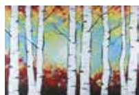
16 AUGUST BIRCH TREES