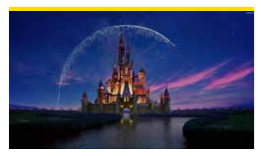
Walt Disney World salutes our military with 2020 Promotional Tickets. Don't miss your chance to see the new Star Wars: Galaxy's Edge attraction.